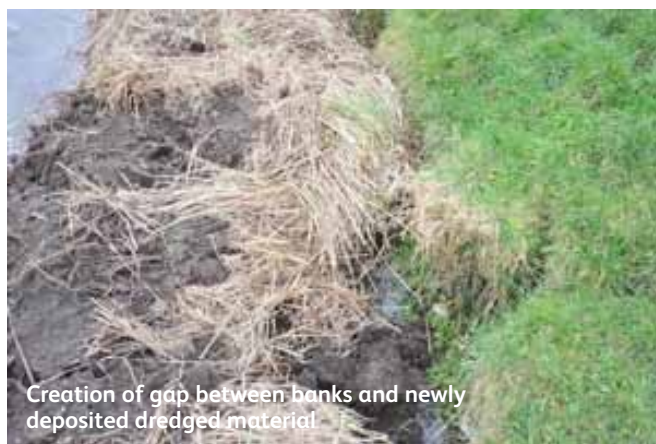
Creation of gap between banks and newly deposited dredged material