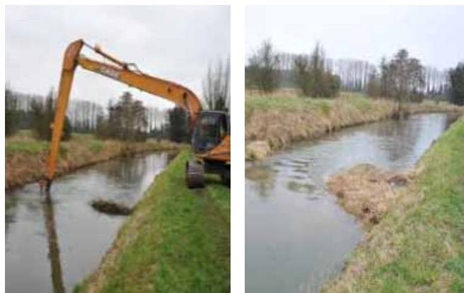
Construction of deflectors using dredged material